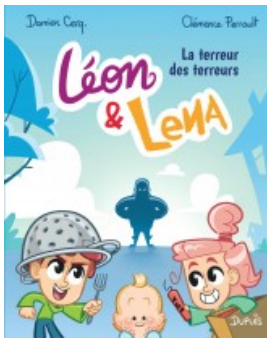
La terreur des terreurs