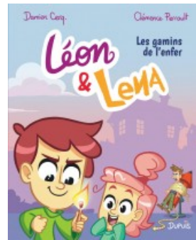
Les gamins de l'enfer