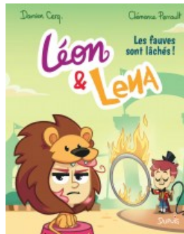
Les fauves sont lâchés