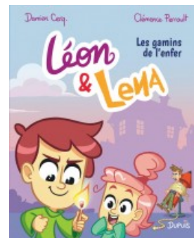
Les gamins de l'enfer