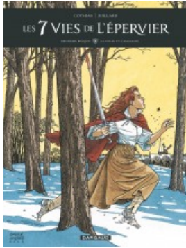
La Folle et l'assassin