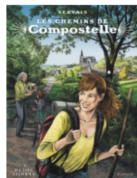
La petite licorne