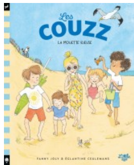
Les Couzz - La Mouette rieuse