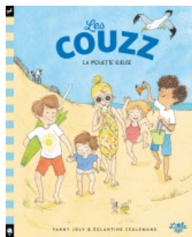
Les Couzz - La Mouette rieuse