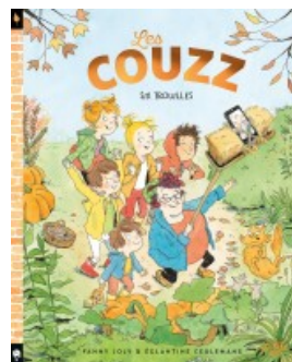
Les Couzz - Six trouilles