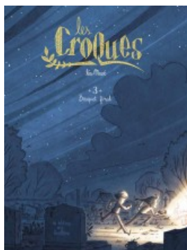
LES CROQUES - Tome 3 - Bouquet Final