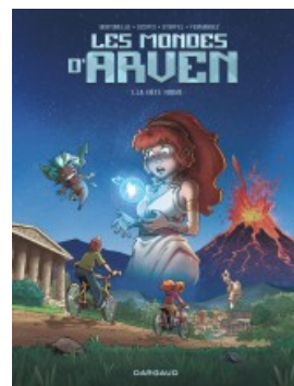
La Bête noire