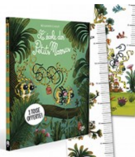
École des Petits Marsus