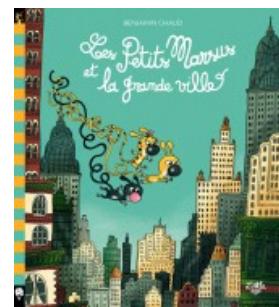
Les Petits Marsus et la grande ville