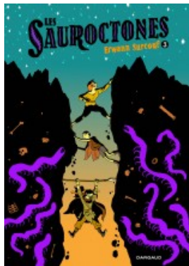
Les Sauroctones - Tome 3