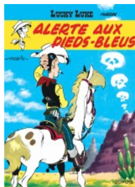
Alerte aux Pieds-Bleus