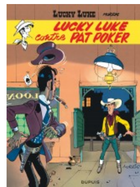
Lucky Luke contre Pat Poker