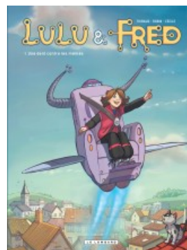
Une dent contre les mémés