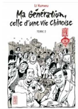
Ma génération T2