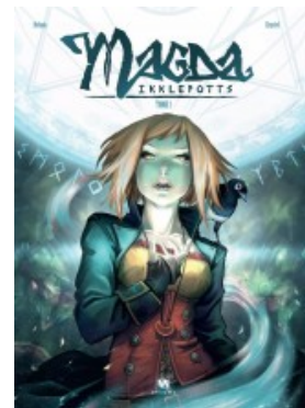
MAGDA IKKLEPOTTS T01