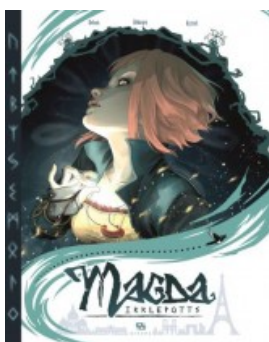
Magda Ikklepotts Int egrale