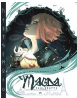
Magda Ikklepotts Intégrale