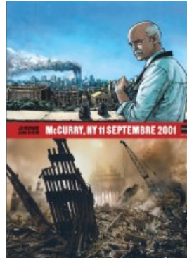
McCurry NY 11 septembre 2001