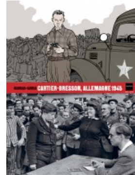
Cartier-Bresson Allemagne 1945