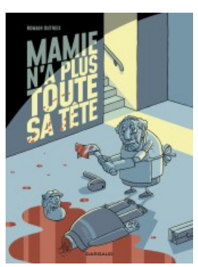
Mamie n'a plus toute sa tête