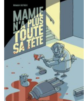
Mamie n'a plus toute sa tête