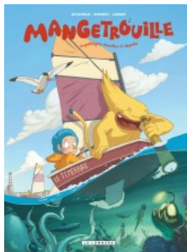
Coquillages chocottes et clapotis