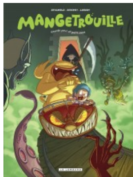
Grande peur et petit creux