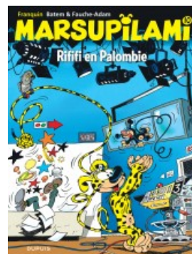
Rififi en Palombie