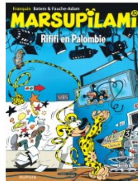
Rififi en Palombie