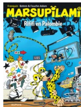
Rififi en Palombie