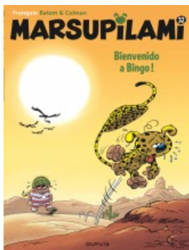
Bienvenuto a Bingo !