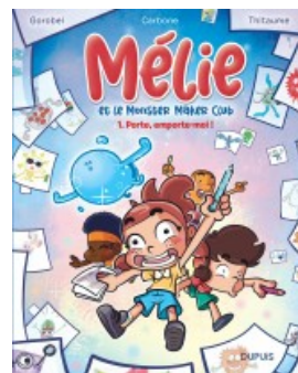
Porte emporte-moi !