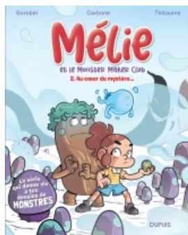
Au coeur du mystère...