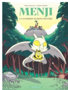
Menji et les ruines du Mont-Mystère