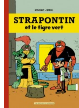
Strapontin - Intégrale