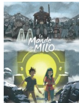
La Terre sans retour - tome 1