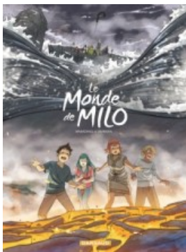
Le Monde Milo - Tome 10