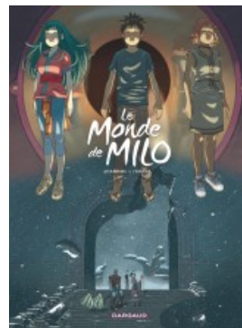
La Terre sans retour - tome 2