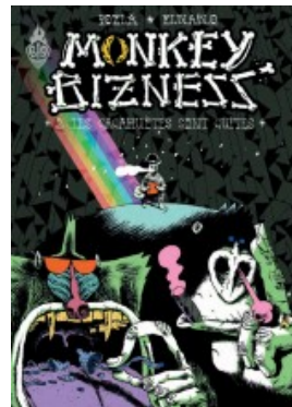
MONKEY BIZNESS 2 LES CACAHUETES SONT CUITES