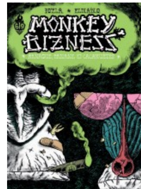
MONKEY BIZNESS 1 ARNAQUE BANANE ET CACAQUETES