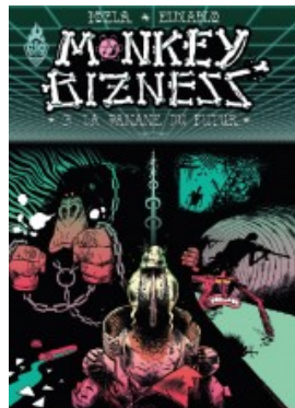
MONKEY BIZNESS 3 LA BANANE DU FUTUR