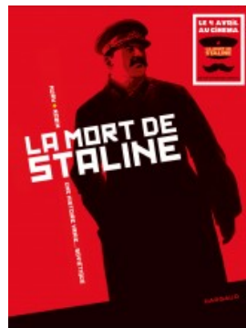
Mort de Staline (La) - Intégrale