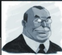
Lavrenti Pavlovitch BERIA 54 ans. Membre du Comité Central du Parti Communiste d'Union Soviétique. Ministre de l'Intérieur.