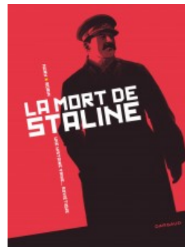
Mort de Staline (La) - Intégrale