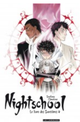
Night School 4