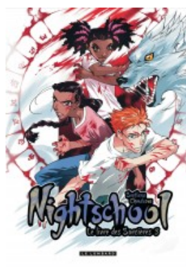
Night school 3