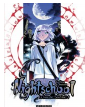
Night school 1