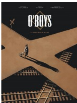
O'Boys - Intégrale complète