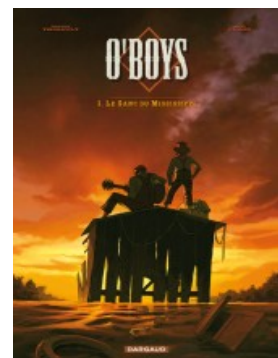
Le Sang du Mississipi