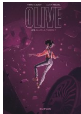
Allô la Terre ?