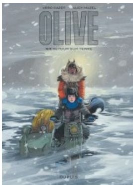
Retour sur terre 4/4