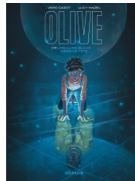
Une lune bleue dans la tête