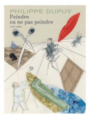
Peindre ou ne pas peindre - L'intégrale