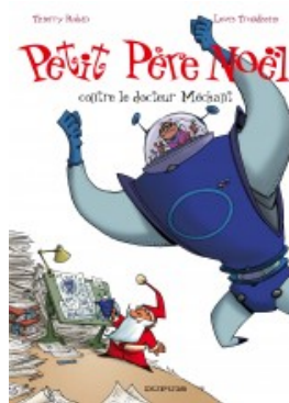
Petit Père Noël contre le docteur Méchant