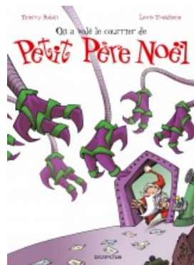
On a volé le courrier de Petit Père Noël