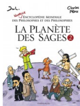
La Planète des sages - tome 2