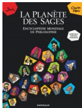
La Planète des sages - Intégrale