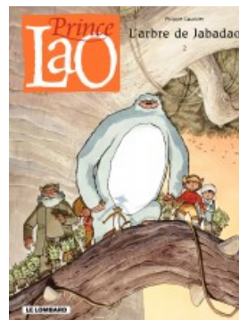
L'Arbre de Jabadao