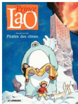
Pirates des cimes