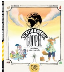
Professeur Goupil autour du monde