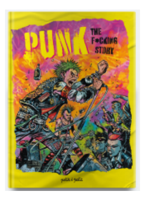
PUNK The f*cking story