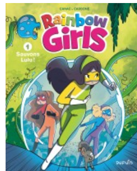
Sauvons Lulu !