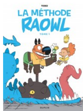
Raowl - La méthode tome 1