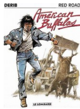
Red Road T1 : American buffalos