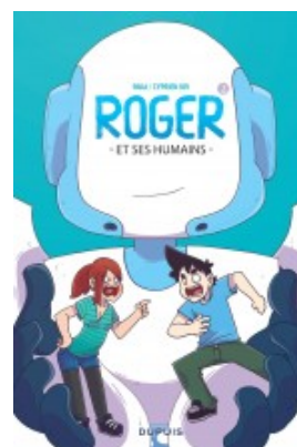
Roger et ses humains 1