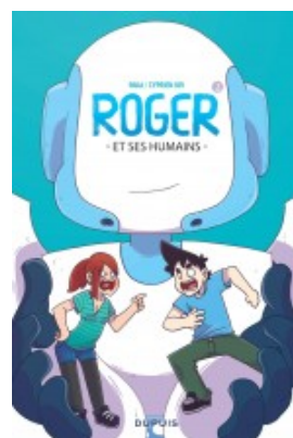
Roger et ses humains 1