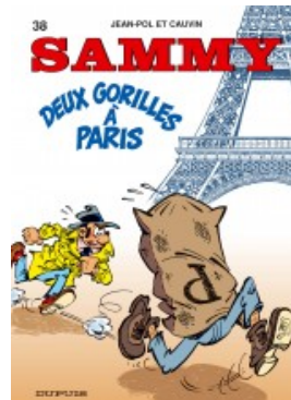
Deux gorilles à Paris