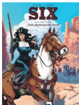
Une montagne d'or