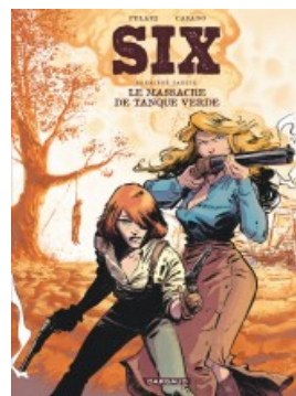
Le Massacre de Tanque Verde