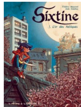
SIXTINE T1 - L'OR DES AZTEQUES