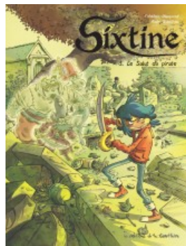
SIXTINE T3-LE SALUT DU PIRATE