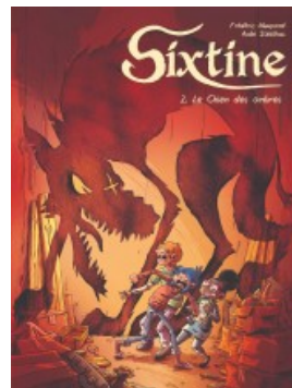
SIXTINE T2 - LE CHIEN DES OMBRES