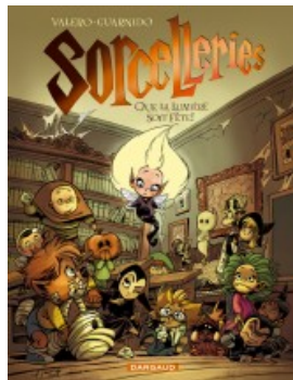
Que la lumière soit fête !