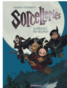
Le Ballet des mémés