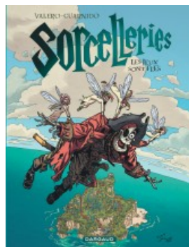
Les Jeux sont fées !