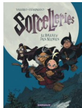
Le Ballet des mémés