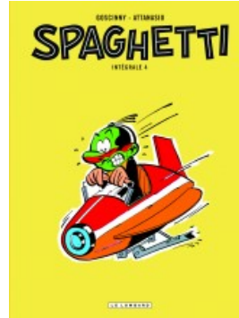
Intégrale Spaghetti 4