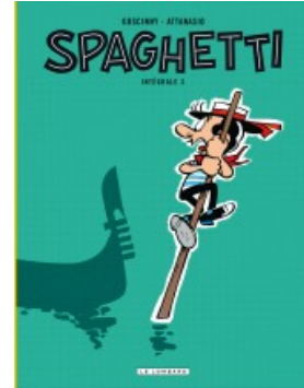
Intégrale Spaghetti 3