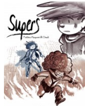
Supers - Intégrale cycle 1