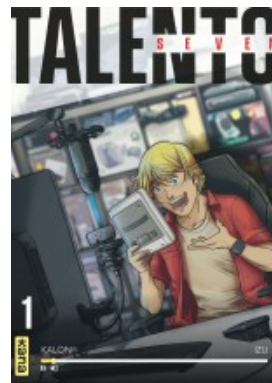
Talento Seven - tome 1