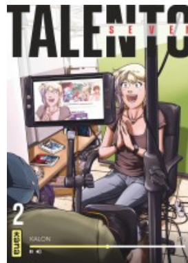
Talento Seven - tome 2