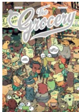
THE GROCERY T04