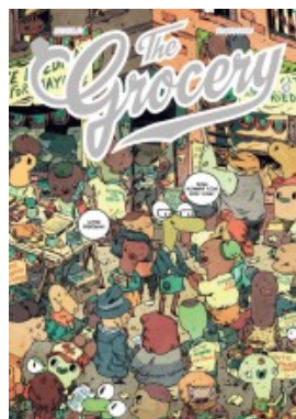
THE GROCERY T04