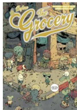
BEFORE THE GROCERY T0