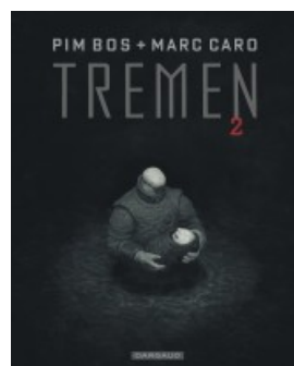
Tremen - tome 2