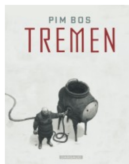
Tremen - tome 1