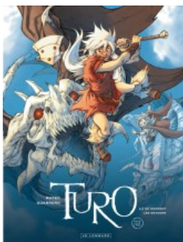
Là où dorment les dragons