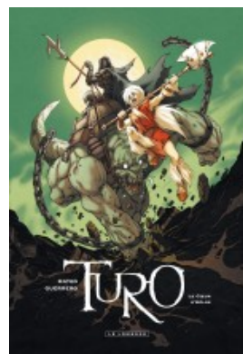
Le Coeur d'Helos