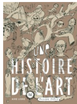
Une histoire de l'art