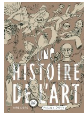
Une histoire de l'art